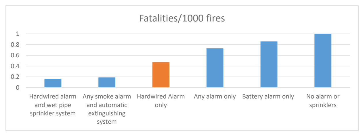
Chart 1: Fatalities per 1,000 fires under alternative fire safety systems expressed as a ratio

The rate of fatality from fire is known to be influenced by a building's fire safety features. Chart 1 reflects the difference in fatality within sole-occupancy units in the presence of different fire safety systems. Hardwired alarms reflect the current requirement for Class 2 and 3 buildings less than 25 metres in height.